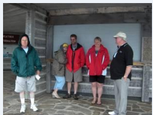
"Where is it cold in July?" OSC's "BRrrrr" Pkwy. Tour