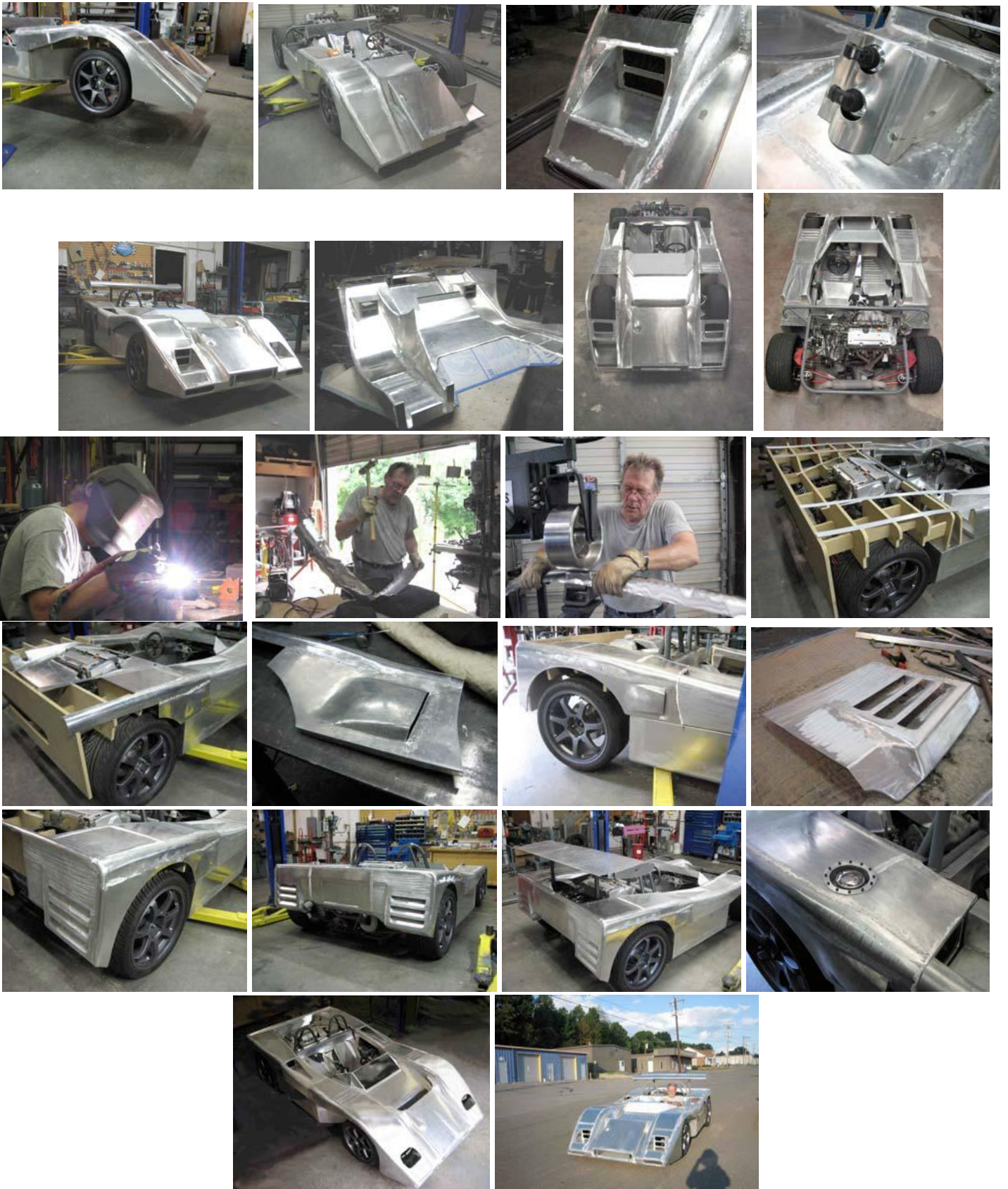
(To be continued in the August Issue of Spinning Wheels)