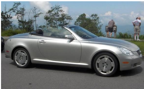
Kermit & Shirley's Lexus 430SC (Future AACA Classic)

They have belonged to many car clubs, but really enjoy AACA and the Old Salem Chapter, including the activities, tours and the people they have met. We are proud to have Kermit and Shirley as part of our Old Salem Chapter family.