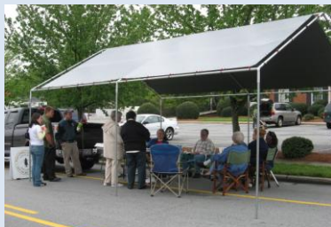
Old Salem Members at '07 Kernersville Car Classic