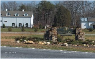
Welcome to Stonefield Cellars Winery