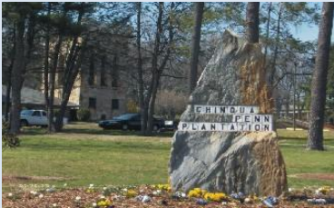
Welcome to Chinqua Penn Plantation