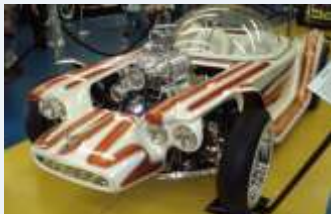
Ed Roth's Beatnik Bandit