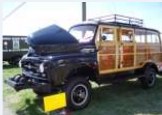
International "Woodie" Bus at Spring Auto Fair